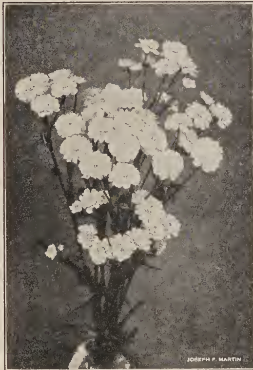
Achillea, Perry's White

PTARMICA, FL. PL. "THE PEARL." Pure white flowers borne in the greatest profusion on strong erect stems the entire summer, 2 feet high. As a summer cut flower it is of great value. An excellent variety for use in sprays.